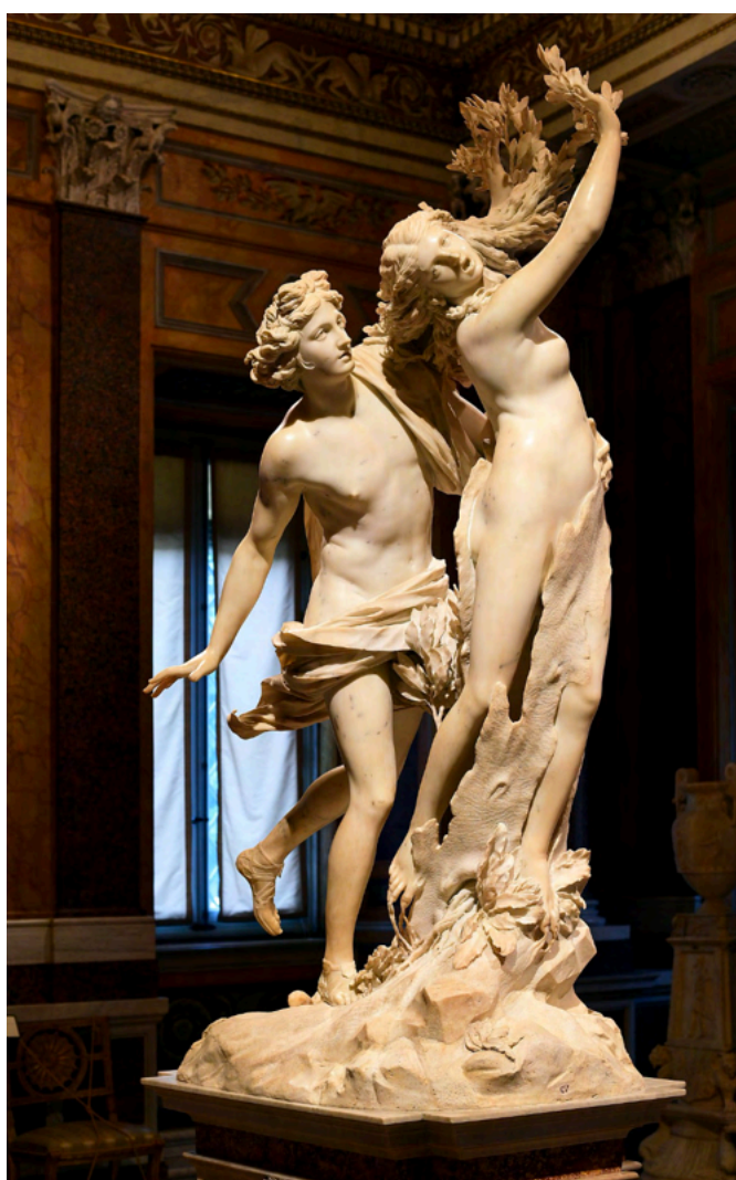
Gian Lorenzo Bernini, Apollo and Daphne, 1622-1625, marble, h 243 cm. Rome, Galleria Borghese

Our reimagining of nature in Flora's fabrics blurs the border between leaves and branches, arms and hands, heart and head. Inspired by the marble "Dafne" by Gian Lorenzo Bernini, wherein the goddesses' arms become laurel branches, our collection evokes classic art within modern tailoring. As in the painting "Santa Lucia" by Francesco del Cossa, we wonder if Flora's eyes are the buds we see or if the buds are her eyes.